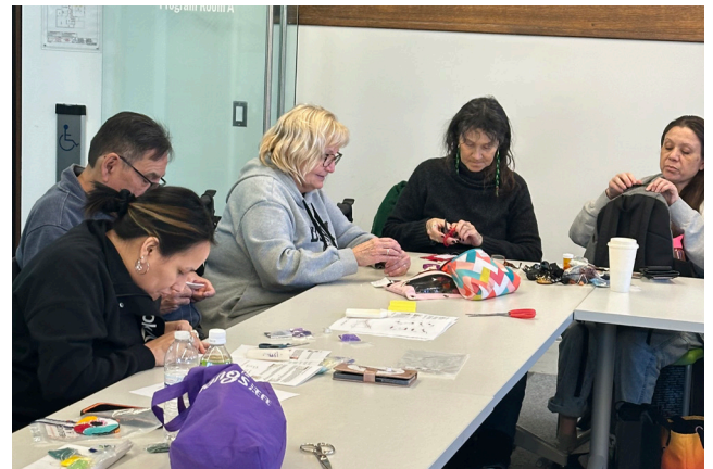
Beading Workshop at St John Library