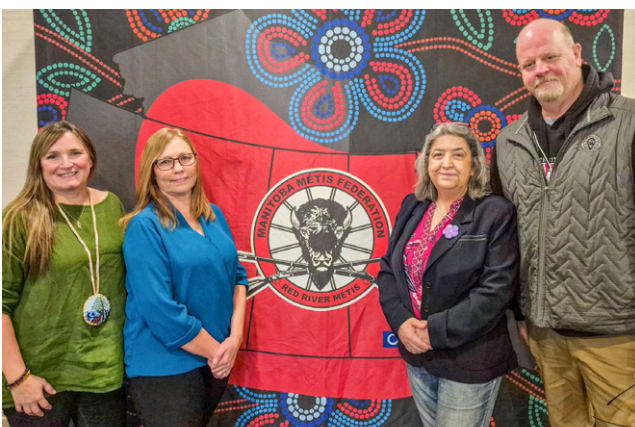
The Louis Riel Institute was honoured to participate in the MMF Four-Pillar Consultation