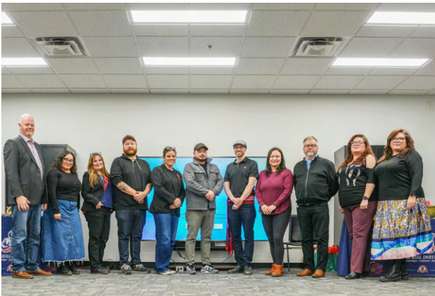
Red River Métis Circle of Educators Advisory Committee Gathering